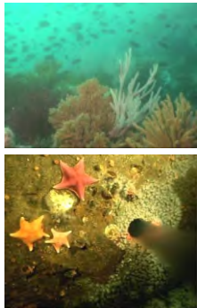
"Artificial reef" of sea life living on offshore pipelines